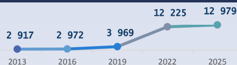
Trade turnover of FEZ residents, thousand of tons

By 2025, the trade turnover of FEZ Grodnoinvest due to new residents is planned to be increased up to 13 mln tons per year.