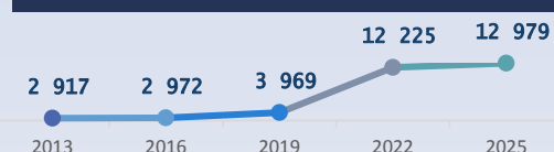
Trade turnover of FEZ residents, thousand of tons

By 2025, the trade turnover of FEZ Grodnoinvest due to new residents is planned to be increased to 13 million tons per year.